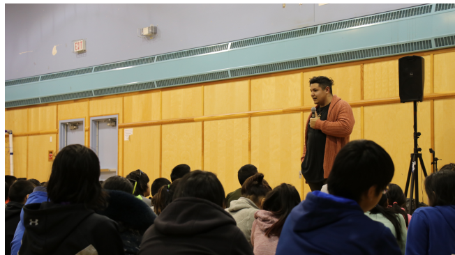
Hope is rising in Nunavut!

One way you can ensure that we continue to TAKE TERRITORY for Jesus is through your partnership with BPEA. We so value your prayers and interest in all that we endeavor to do, and we want you to know what a vital part you play in helping us accomplish God's purpose and mandate to TAKE TERRITORY for Him "from sea to sea and...from the river to the ends of the earth." The harvest is ripe! Hearts are ready! NOW is the time to partner with us to TAKE NEW TERRITORY in Canada!