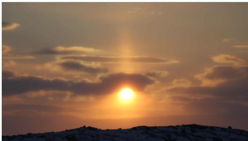
Sunset over Iqaluit - Hope is rising in Nunavut!

Through Legion's deliverance, Jesus sparked something exciting and brought a message of HOPE to those who witnessed the miracle. Legion begged to join Jesus and His disciples in their travels, but Jesus showed him a much more effective way of reaching people. He said, "Go home to your family (your territory ), and tell them how much the Lord has done for you and how merciful He has been to you." So the man left and began proclaiming in the Decapolis how much Jesus had done for him. And everyone was utterly amazed." (Mark 5:18-20).