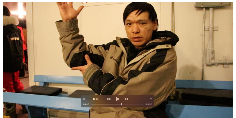
Man in Kimmirut was healed of a broken arm in the service! 20 young people came to the Lord that evening.